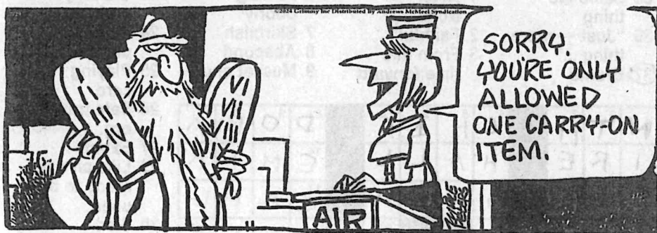
MOTHER GOOSE & GRIMM: By Mike Peters

===== Bible fun fact: 12 Books of the Bible begin with the letter "J." Which ones can you think of off the top of your head?