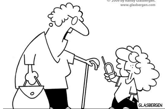
"Wireless communication is nothing new. I've been praying for 75 years!"