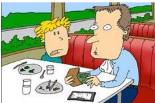
HOW COME THE WAITRESS GETS 15% AND GOD ONLY GETS 10%?

Thanks to those already using E-giving (see above).