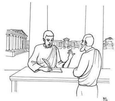
“There I go—still writing ‘B.C.’ on my checks.”

Did you notice a lot of First Readings this month are not from the Old Testament? They are taken instead from the New Testament book attributed to St. James who was a leader of the Christian community in Jerusalem and an advisor to St. Paul. He wrote an epistle (letter) to the 12 Tribes of Israel which is rife with sayings of Jesus, whom James followed.